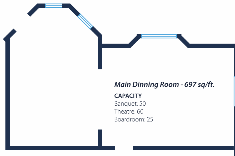
Main Dining Room - 697 sq/ft.

CAPACITY Banquet: 50 Theatre: 60 Boardroom: 25